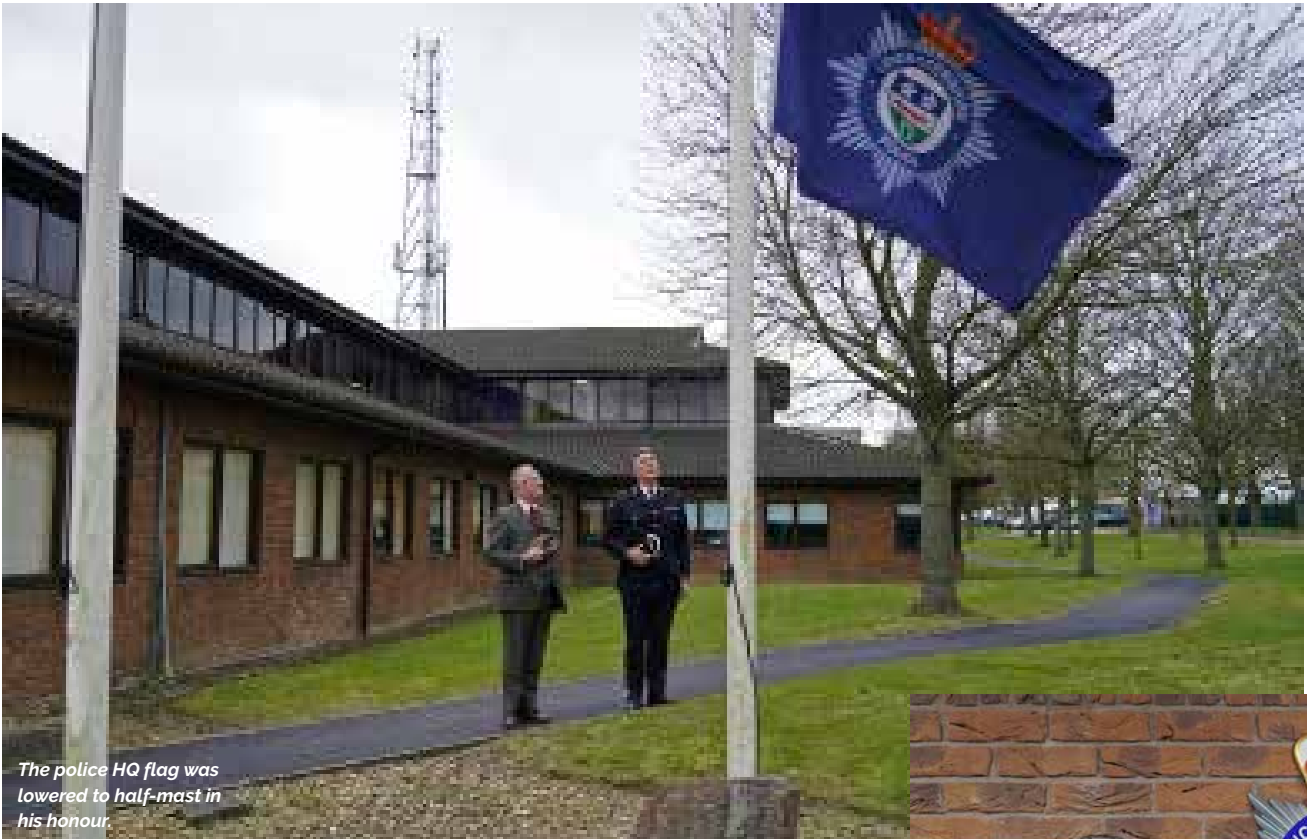
The police HQ flag was lowered to half-mast in his honour.