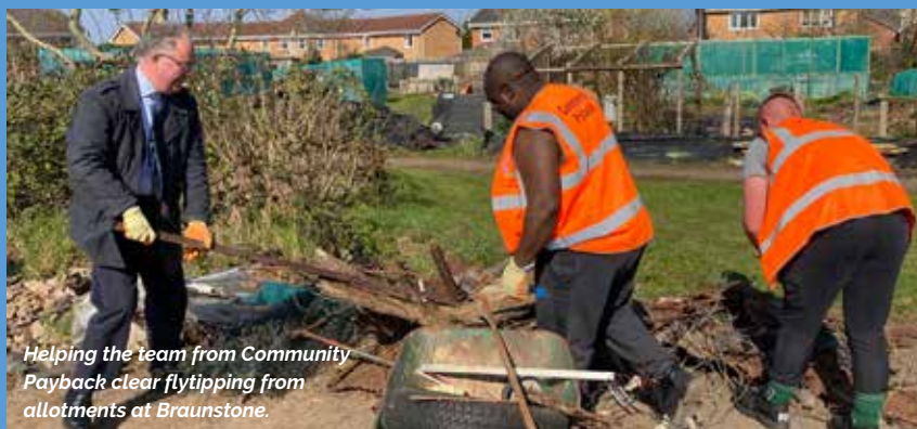
Helping the team from Community Payback clear flytipping from allotments at Braunstone.

The scheme is an alternative to prison and helps offenders recognise the impact of their crimes on victims and the wider