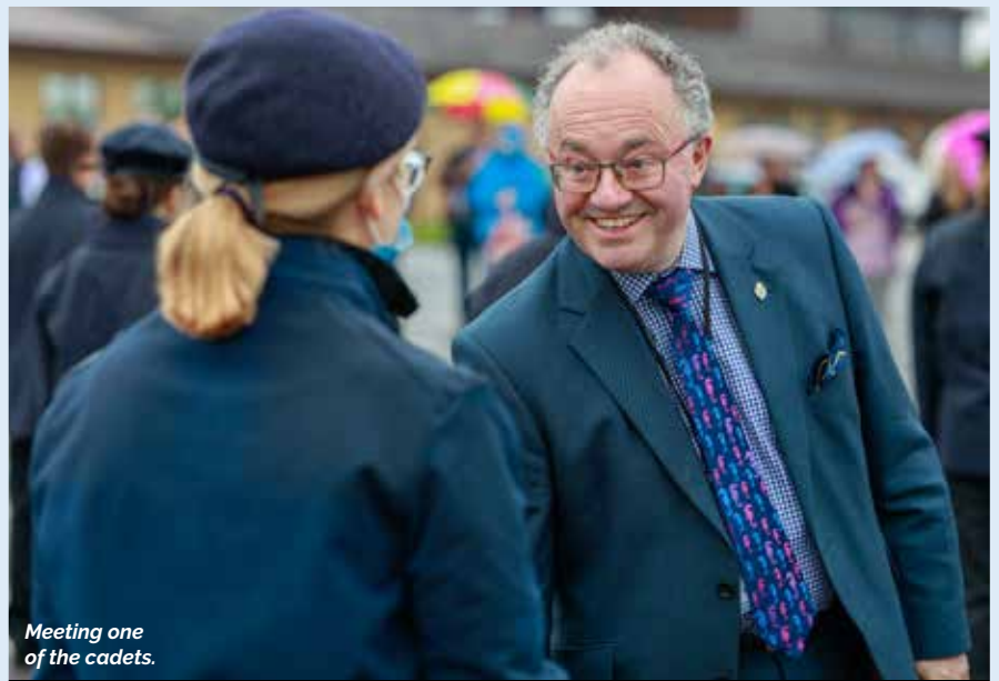
Meeting one of the cadets.

This operation has meant an additional 178 officers for Leicestershire Police by the end of year 2. However, we have recruited 329 officers by Dec 21. This is an additional 7% over our Op Uplift allocation based on year 2.