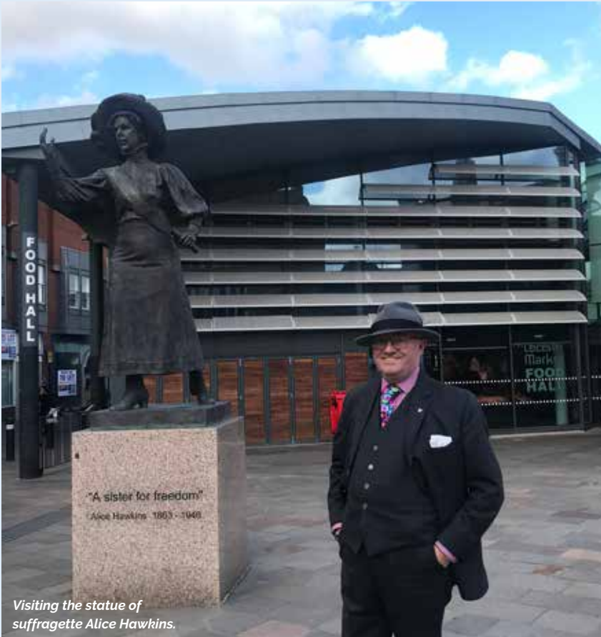
Visiting the statue of suffragette Alice Hawkins.