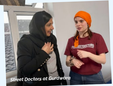
Street Doctors at Gurdwara