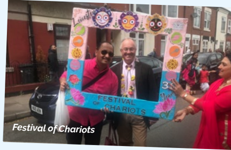
Festival of Chariots