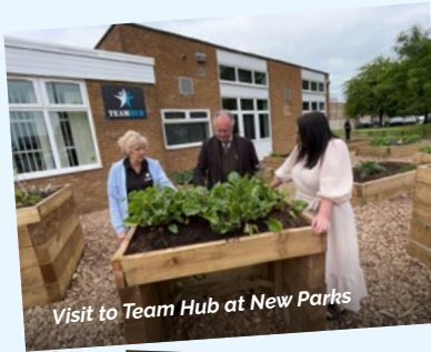
Visit to Team Hub at New Parks