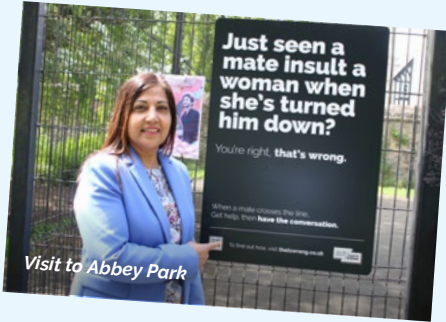
Visit to Abbey Park