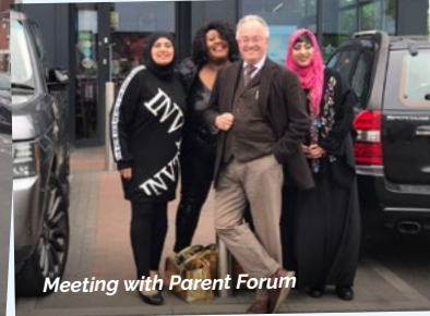
Meeting with Parent Forum