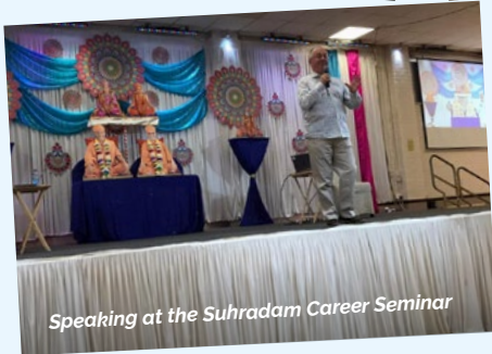
Speaking at the Suhradam Career Seminar