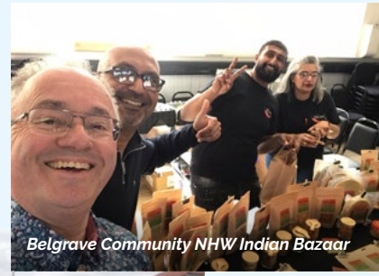
Belgrave Community NHW Indian Bazaar

I spend one day each week out in the community. It is an essential part of my job to meet local residents, find out what they want and then translate that into action.