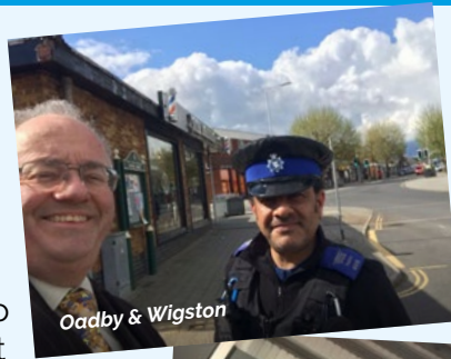
Oadby & Wigston

I spend one day each week out in the community. It is an essential part of my job to meet local residents, find out what they want and then translate that into action.