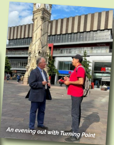
An evening out with Turning Point