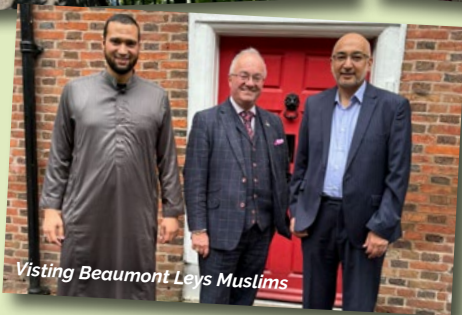
Visiting Beaumont Leys Muslims