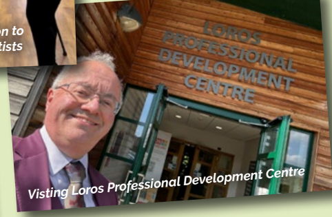
Visiting Loros Professional Development Centre