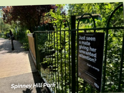
Spinney Hill Park