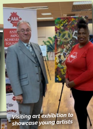
Visiting art exhibition to showcase young artists