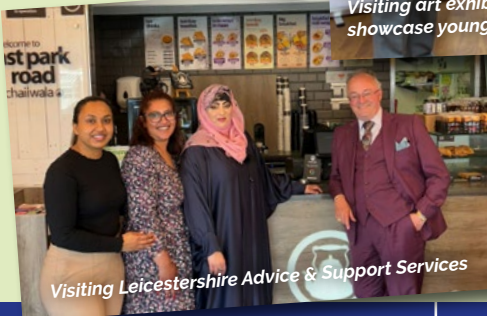
Visiting Leicestershire Advice & Support Services