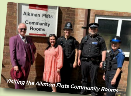
Visiting the Aikman Flats Community Rooms