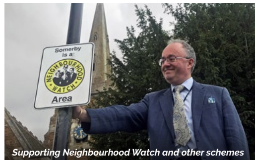
Supporting Neighbourhood Watch and other schemes