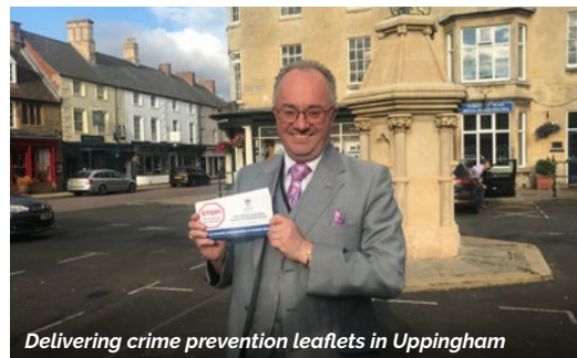
Delivering crime prevention leaflets in Uppingham