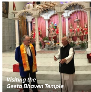
Visiting the Geeta Bhaven Temple