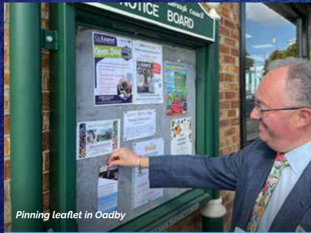
Pinning leaflet in Oadby