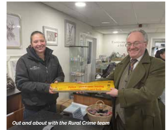
Out and about with the Rural Crime team

I believe that communication is as much about listening as informing, as such I established a Commissioners Advisory Group for a year to further enhance my reach into those hard-to-reach communities and to receive feedback directly from influential members of the community, this group has been monumental in receiving first hand feedback from the community.