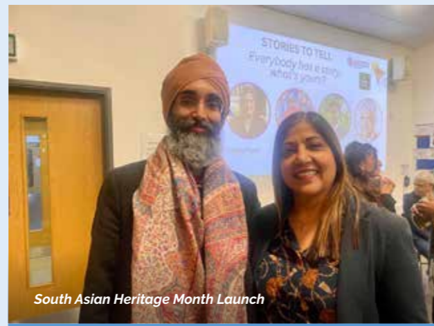
South Asian Heritage Month Launch