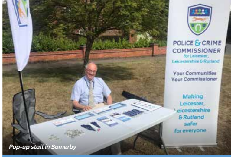
Pop-up stall in Somerby

I have also responded directly, in written format, to 642 contacts from local residents and stakeholders.