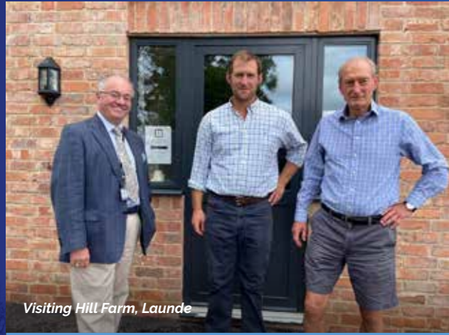
Visiting Hill Farm, Launde