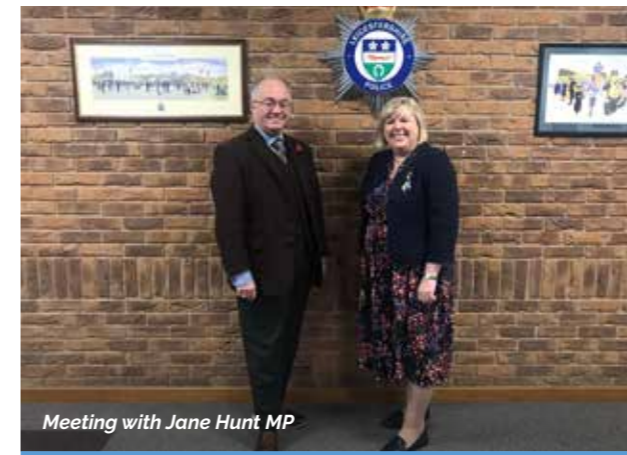
Meeting with Jane Hunt MP

I have also held regular meetings with local MPs, both on their 'patch' and in my office, to see how they can take local issues to Westminster and equally, how they can support my own work to improve community safety. In addition, local MPs are invited to regular updates with the Chief Constable and myself, providing an excellent two-way dialogue.