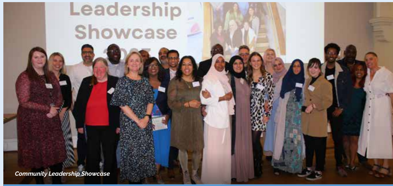
Community Leadership Showcase

Participants from this and the two previous cohorts have now joined the wider Community Leaders Network which works in partnership with statutory bodies to support communities, with People Zones as one of their focusses.