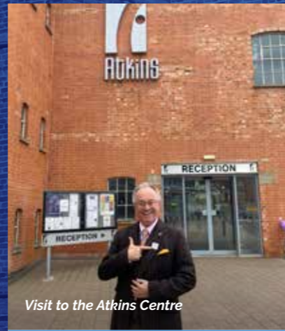
Visit to the Atkins Centre