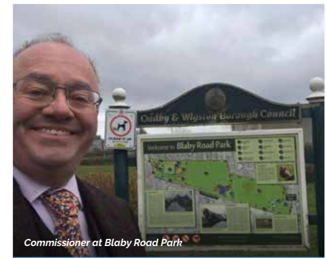
Commissioner at Blaby Road Park