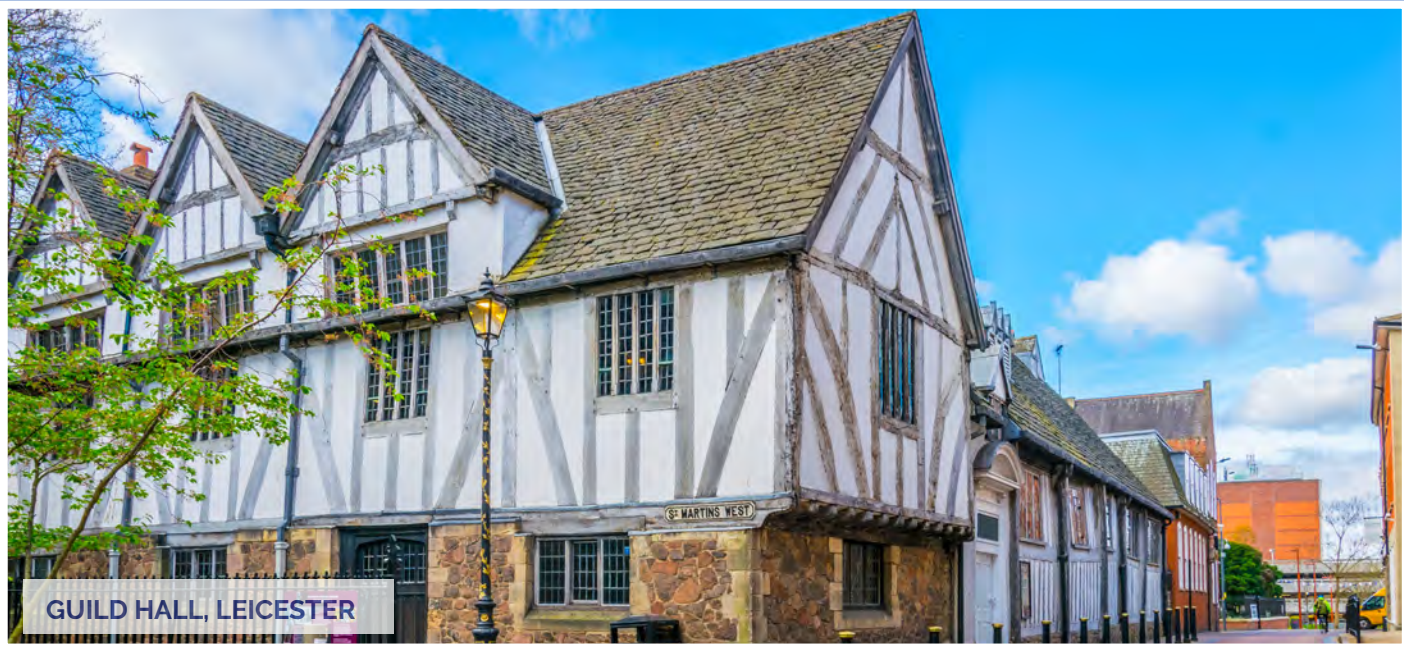
GUILD HALL, LEICESTER