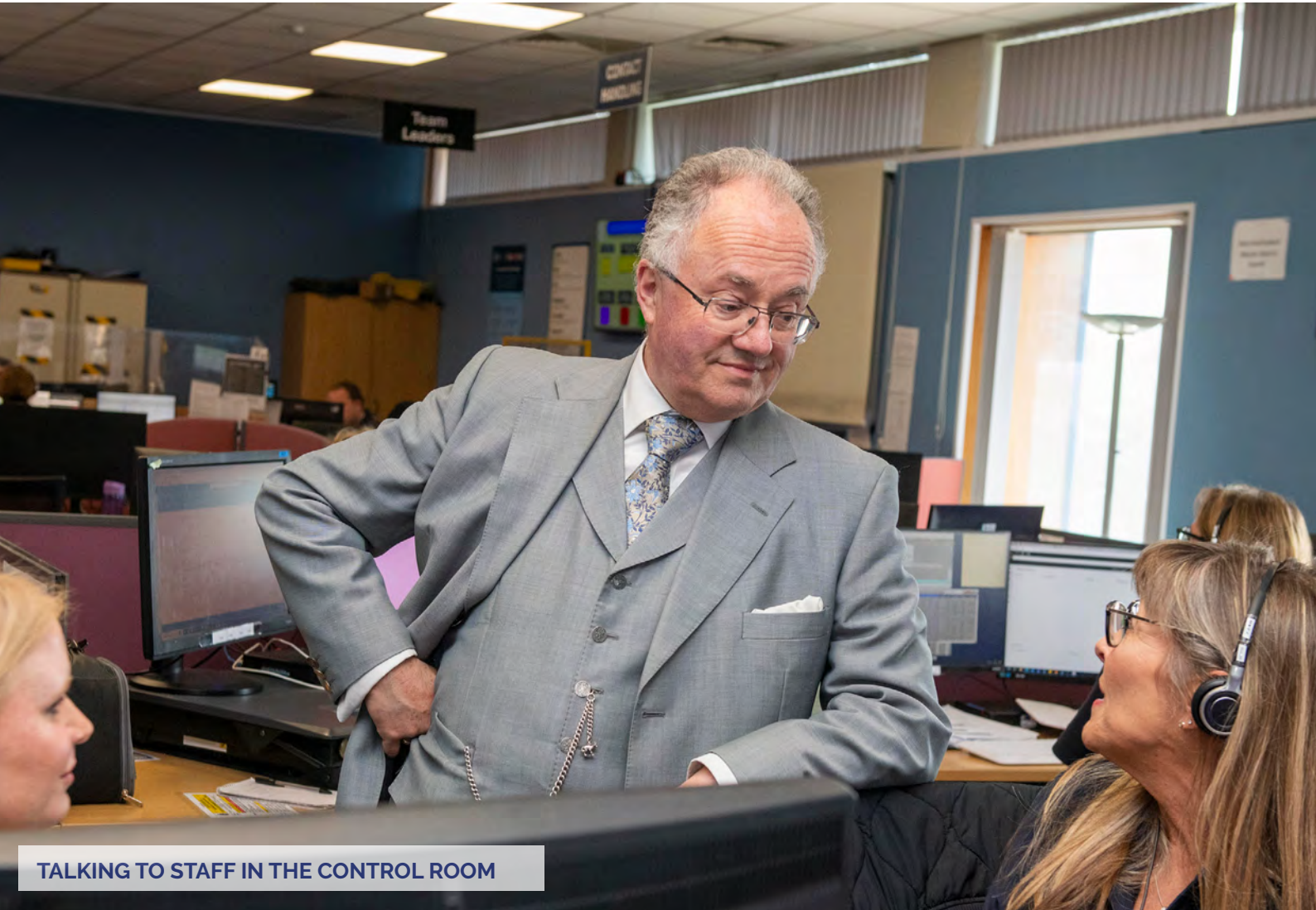
TALKING TO STAFF IN THE CONTROL ROOM

The funding grant for Leicestershire is unfair and the government urgently needs to review the outdated, disproportionate funding formula. I have repeatedly raised with the last Government and will continue to lobby the new one, that the funding formula in place for policing needs urgent review. Unfortunately, that has not been forthcoming. Leicestershire Police works hard to ensure that the best service is delivered within the funding that is received. However, that is getting harder and harder to do each year without fundamental reform. If this is not forthcoming from the national government then local action may be required.