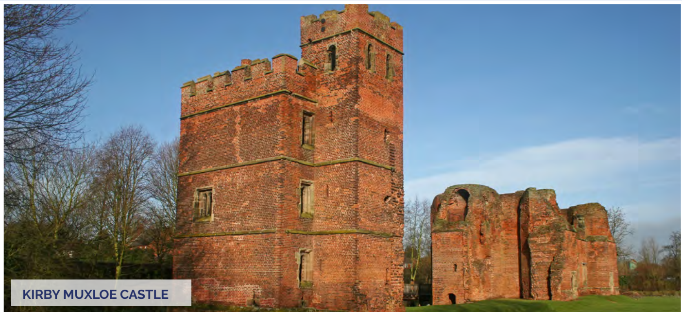
KIRBY MUXLOE CASTLE