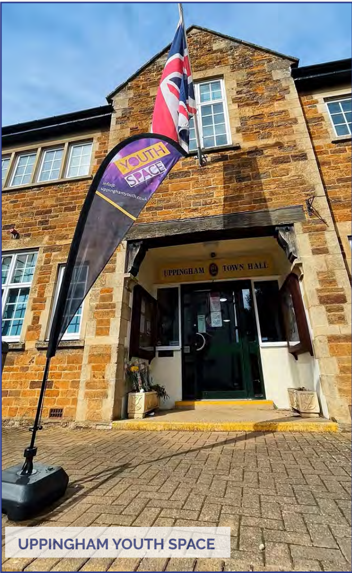
UPPINGHAM YOUTH SPACE