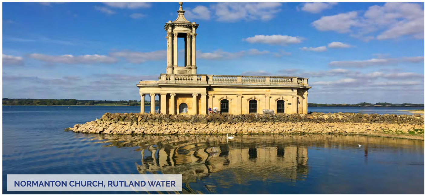
NORMANTON CHURCH, RUTLAND WATER