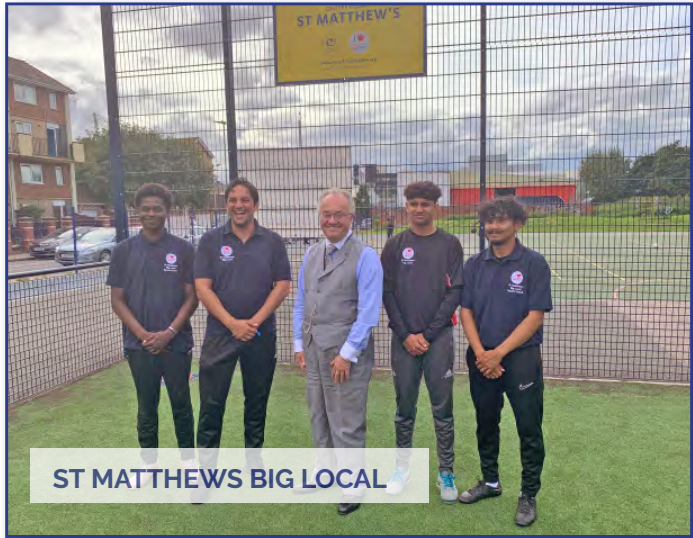
ST MATTHEWS BIG LOCAL