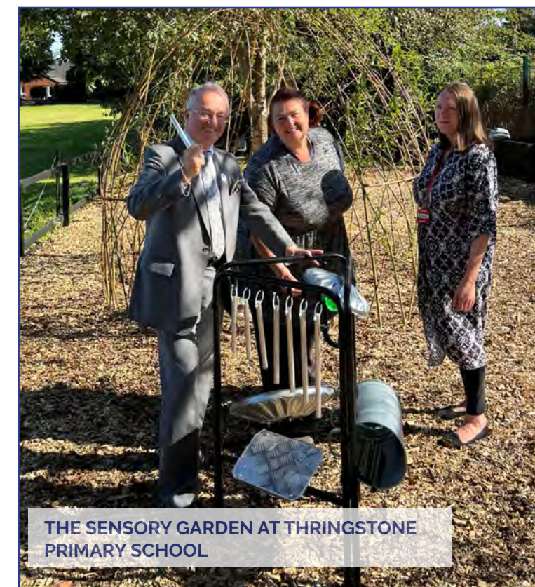
THE SENSORY GARDEN AT THRINGSTONE PRIMARY SCHOOL

An evaluation of People Zones to understand how the project is progressing has been carried out by Mapping for Change, based on data from 2022 to 2023 to ensure 12 months was captured from the relaunch of People Zones.