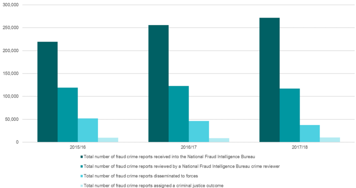
Figure 1: Number of crime reports received, reviewed by a National Fraud Intelligence Bureau reviewer, disseminated to forces and assigned a criminal justice outcome in England and Wales in 2017/18

1.37. Despite the number of reported frauds increasing over the last three years, the number of cases disseminated to forces for investigation has reduced while the number receiving a criminal justice outcome has remained relatively static. Figure 1 shows the number of frauds reported over recent years and those allocated a criminal justice outcome.